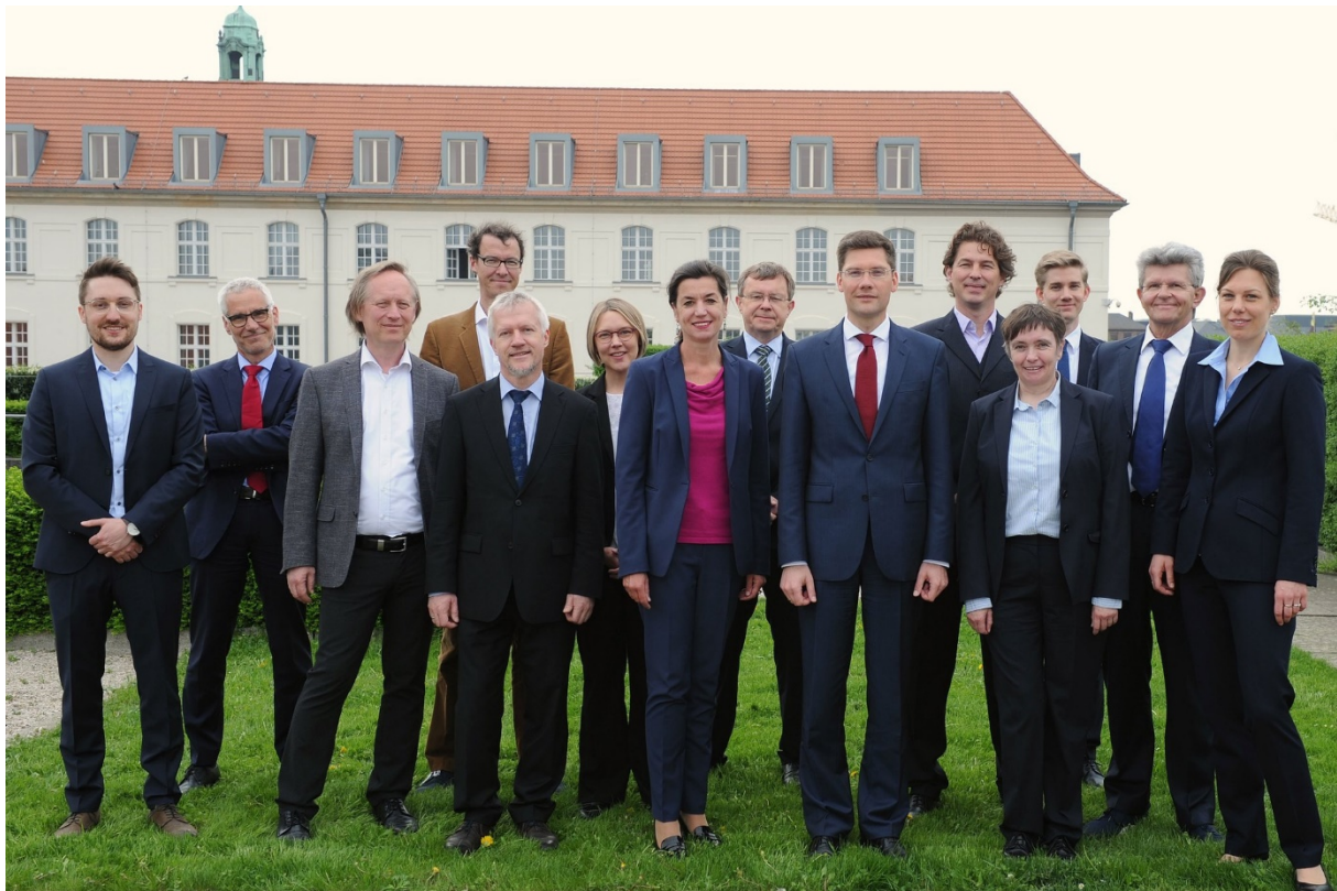
Round Table Mittelstand (Berlin 24 th of April, 2018)